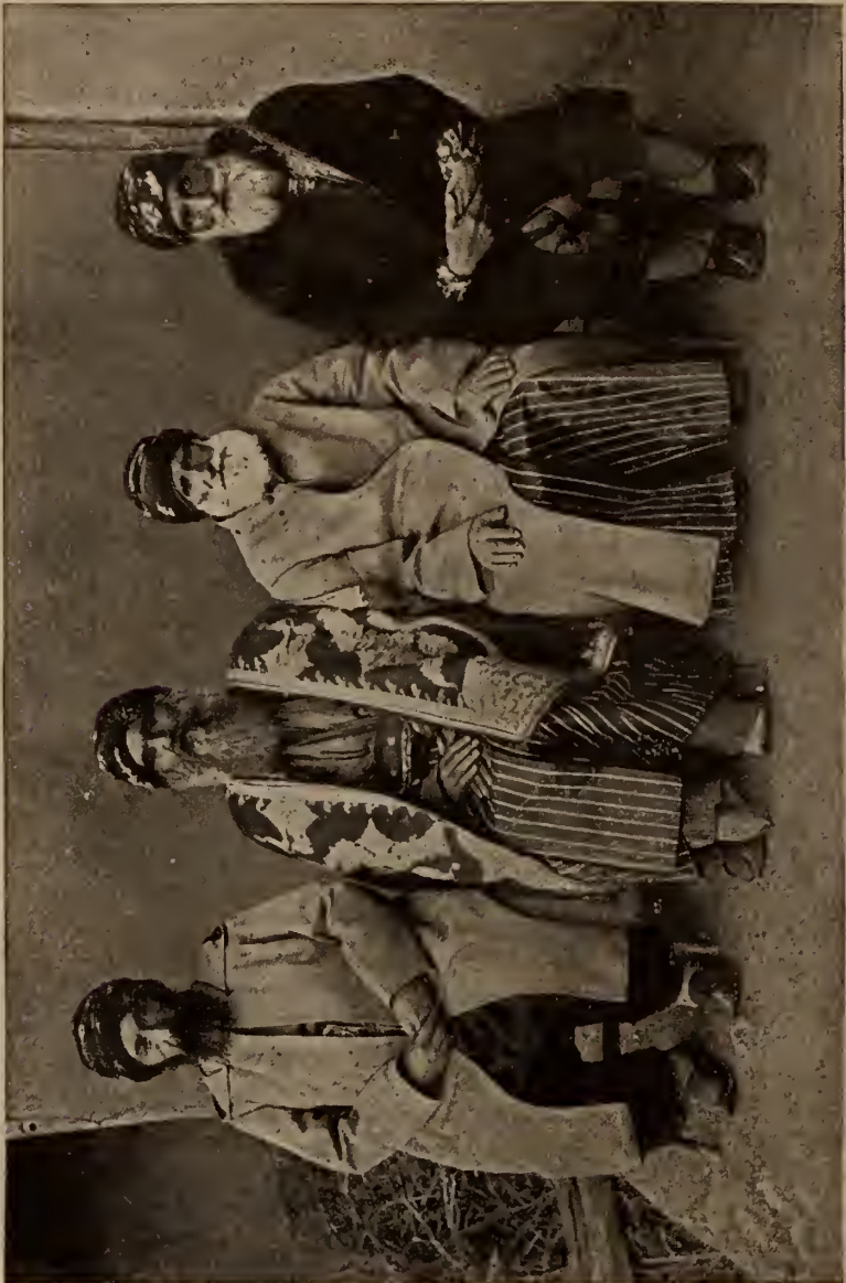
PROMINENT KUZZEL-BASH KOORDS.

any attempt to control them as an unjust invasion of their rights, to which they submit only by compulsion. Sometimes they pay taxes, sometimes not; but they decline to furnish men for the army. The government proposes to send soldiers among them this year to bring them into closer allegiance.